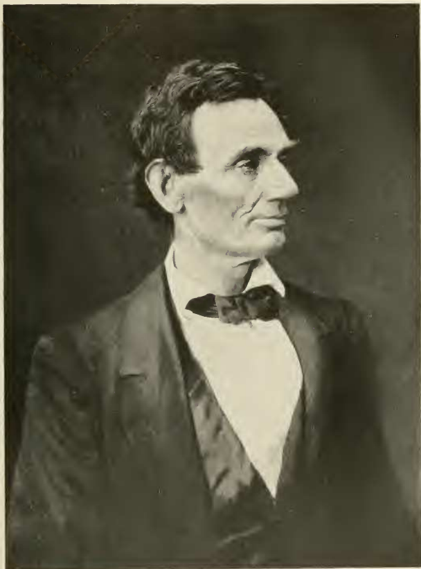
RETOUCHED PRINT FROM NEGATIVE SHOWN IN PLATE 1